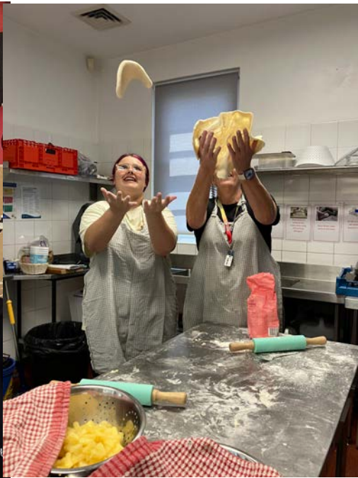
JO - CANTEEN CO- ORDINATOR